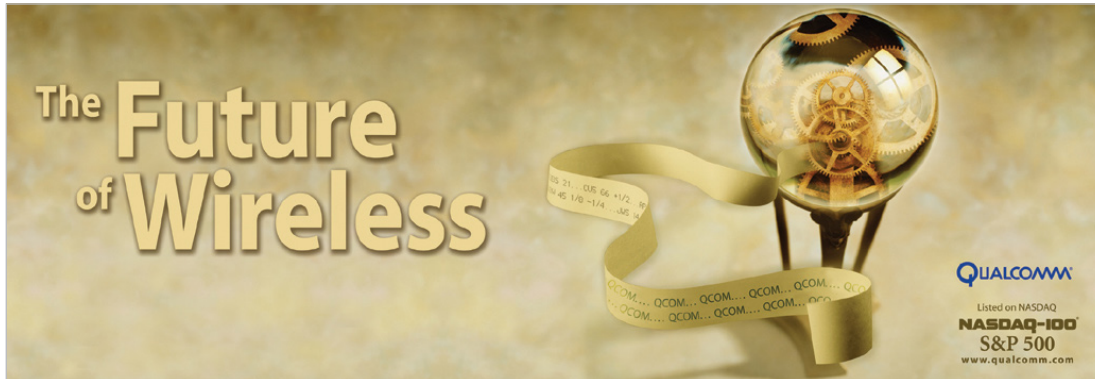
Client: Qualcomm, inc. Project: Airport signage spotlighting investing in Qualcomm as the Future of Wireless Role: Art direction & concept, photoshop montage & production