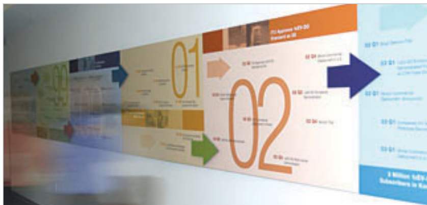
Client: Qualcomm, inc Project: History of Qualcomm engineering highlights on wall panels in main hall - Years 1998 - 2005 Role: Design & production; worked within marketing