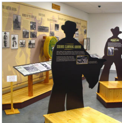
Client: Alchemy of Design / Spot Color Project: 3D museum designs for Pendleton Hall of Fame Role: Design & production; worked with studio